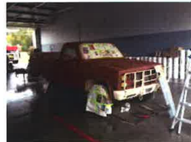
Figure # 1 - Service 1962